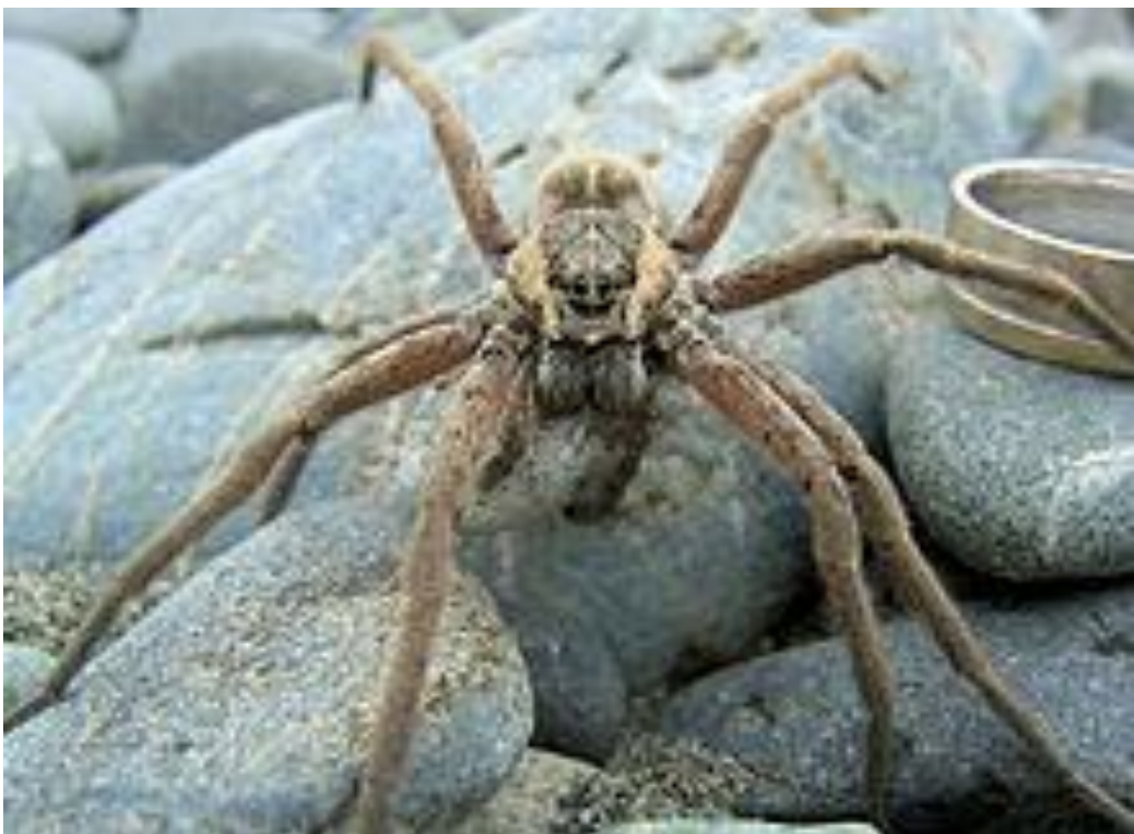
Tarata Water Spider