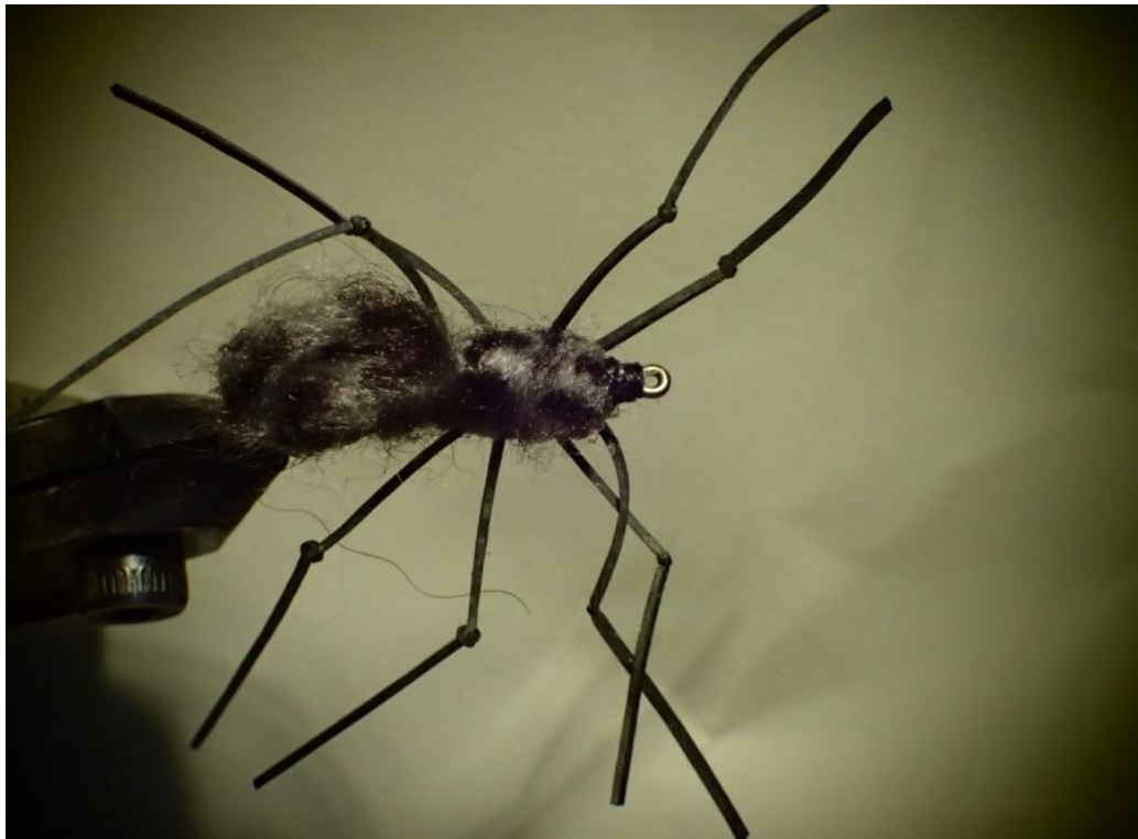
New Zealand Water Spider Fly